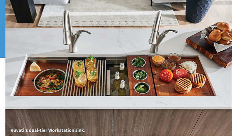
Ruvati's dual-tier Workstation sink.

ment that is earthy yet industrial. The Alton vanity can be customized according to customer preference, from the length, countertop and bowl designs to hardware style and metal accents. The Alton is a smart choice for any décor, packing ample storage into compact spaces for today's multitasking bathrooms.