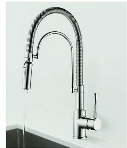
The K503PC faucet from Lenova.

Another part of the kitchen that is a prime target for upgrade is the faucet. Dramatic faucets are one of the hottest trends in kitchen design, but they also serve important practical functions. Lenova perfected the balance between form and function with its new designer solid-brass kitchen faucets. With graceful high-arch spouts and gleaming metallic finishes, they are natural focal points in the kitchen.