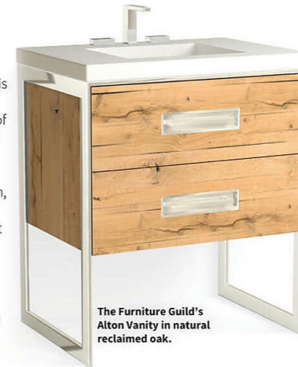
The Furniture Guild's Alton Vanity in natural reclaimed oak.

The combination of wood and metal makes a dramatic style state-