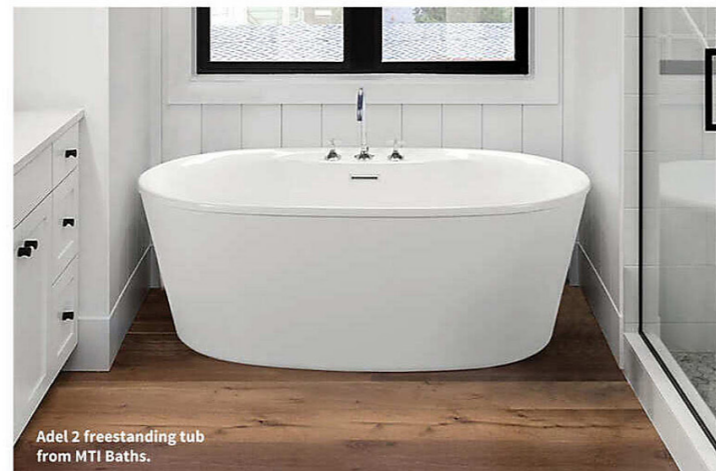
Adel 2 freestanding tub from MTI Baths.

In keeping with MTI's high standards for quality and construction, the Adel 2 is