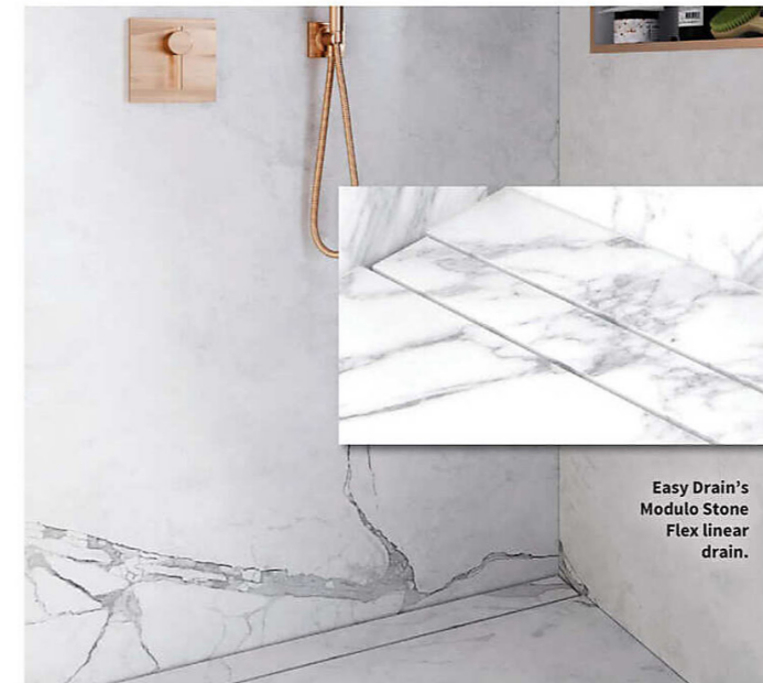
Easy Drain's Modulo Stone Flex linear drain.

Our industry responded with amazing new product lines to meet those needs. We look forward to seeing what innovations are yet to come as the year unfolds.