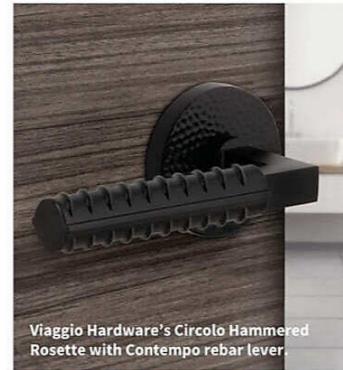
Viaggio Hardware's Circolo Hammered Rosette with Contempo rebar lever

With remote working here to stay, door hardware needs to keep up. Viaggio Hardware makes it easy to define spaces with extraordinary designs offering plenty of custom options. Its new Motivo Collection is particularly appealing, with textured finishes introducing a tactile element to the décor. Choose from an embossed linen look that is elegant and sophisticated, a distinctive hammered finish for a