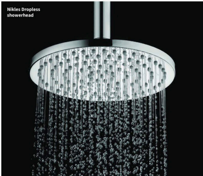
Nikles Dropless showerhead