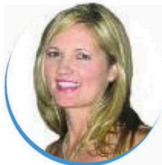
BY LINDA JENNINGS Kitchen & bath specialist

Express your style with these new kitchen and bath trends.