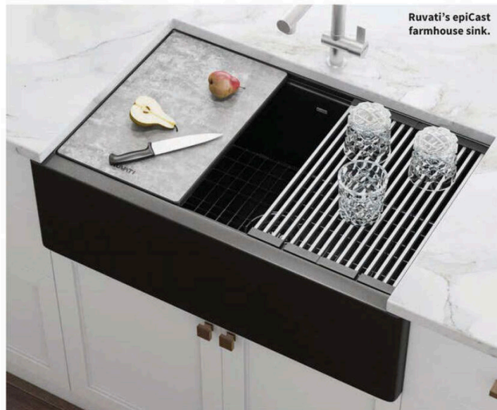
Ruvati's epiCast farmhouse sink.