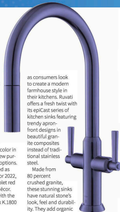
Isenberg's Velox faucet with Very Peri purple color.

Ruvati builds its epiCast sinks with thick, solid construction that is naturally sound-absorbing and resistant to scratches and extreme temperatures. The sinks come with integrated ledges and accessories to enhance functionality and are covered by a limited lifetime warranty.