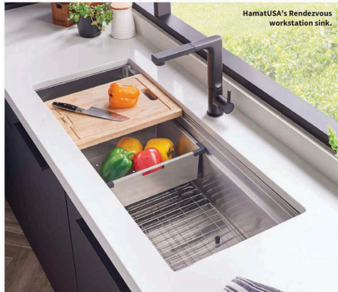
HamatUSA's Rendezvous workstation sink.

No detail is overlooked; even screw mechanisms are carefully hidden with the company's concealed screw mechanism for a seamless installation. Viaggio Hardware is crafted in the heart of Europe using a singular combination of expert engi-