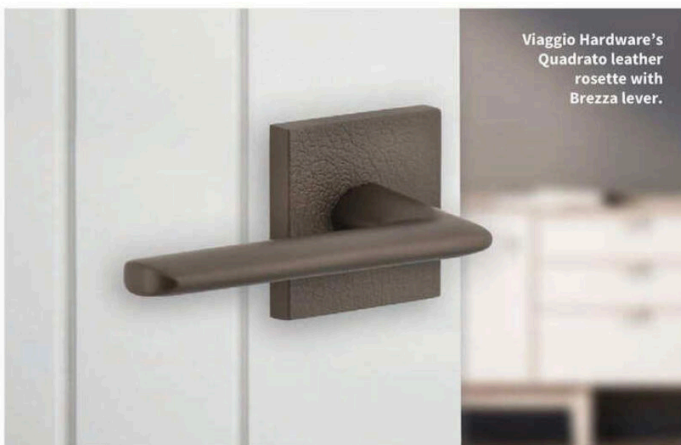
Viaggio Hardware's Quadrato leather rosette with Brezza lever.

MAXIMIZE THE POWER OF THE HOME WITH DESIGN CHOICES THAT PROVIDE THE GREATEST SENSE OF WELCOME AND COMFORT.