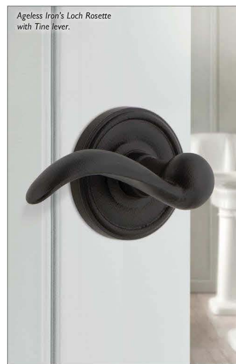
Ageless Iron's Loch Rosette with Tine lever.

These products are just a few examples of the array of possibilities when it comes to a springtime revamping of the kitchen and bath. We love embarking on a new year with a redesign project and appreciate the inspiration and global allure of our industry's latest design trends. ●