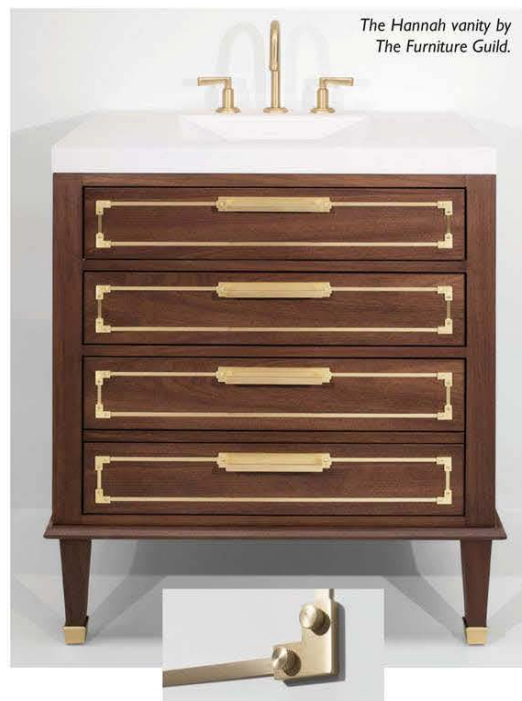
The Hannah vanity by The Furniture Guild.