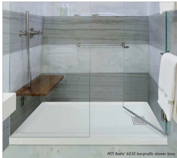
MTI Baths' 6030 low-profile shower base.

For more information about these luxurious brands, visit their respective websites at: