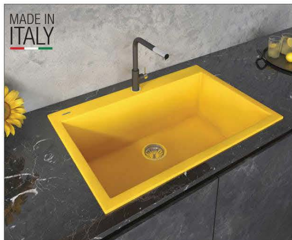
Ruvati's Midas Yellow epiGranite sink.

THIS BRIGHT YELLOW HUE WAS INSPIRED BY THE ICONIC ITALIAN SPORTS CAR MAKER FERRARI, MAKING THE COLOR A PERFECT FIT FOR THE ITALIAN-MADE SINKS.