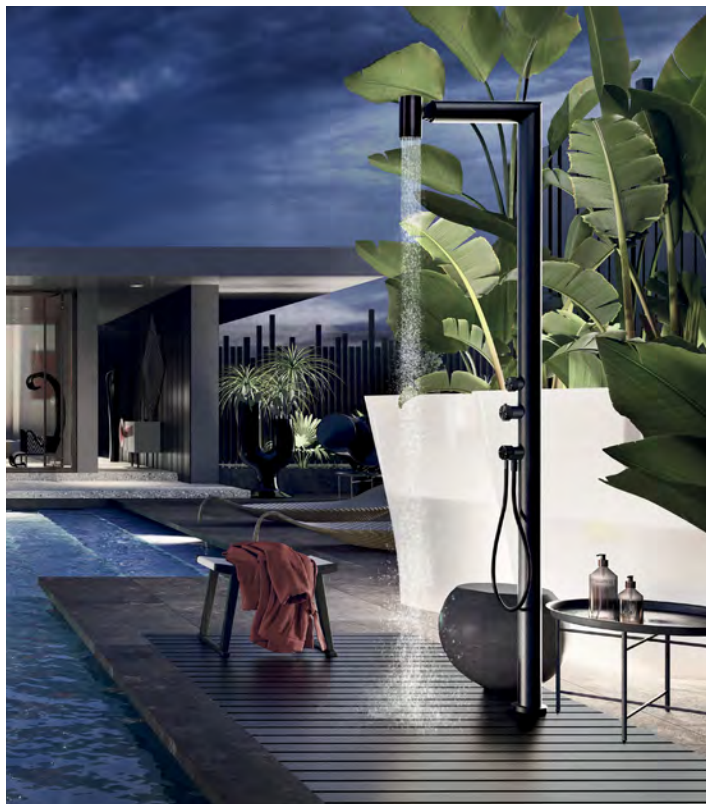
Gessi's New Outdoor Shower

www.acquabella.us • www.hardwarerenaissance.com www.ruvati.com • www.sterlinghamco.uk www.gessi.com