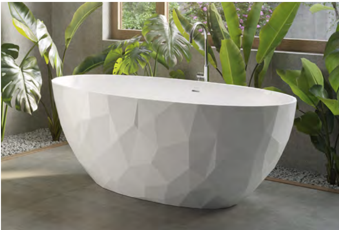
Acquabella Stelvio freestanding bath

white geometric prism. These new luxury builder products are an excellent representation of refined designs, intuitive finishes and exceptional materials sure to add classic sophistication to your dwelling space. Now is the time to embark on a new era of home design with these forever pieces.