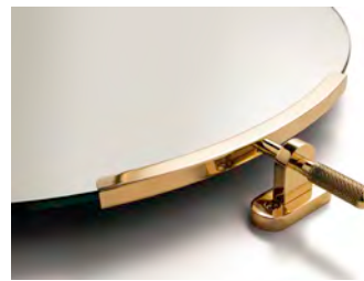
Sterlingham Company's Industrial Mirror

The industrial look continues to be in hot demand with consumers and designers alike clamoring to achieve the urban-inspired vibe. The new Industrial Mirrors by Sterlingham Company Ltd. are a wonderful addition to any design space hoping to create this classic style. Available in round, oval and rectangular designs, these mirrors feature lathe-formed parts with knurled detailing perfect for an industrial theme. The mirrors are made from a high quality 6mm thick mirrored glass that is held securely in place with wall brackets at the top and bottom. The brackets are offered in a selection of 16 finishes including Gun Metal, Brushed Brass, Polished Nickel and Matte Black. In keeping with the brand's reputation for exceptional quality and craftsmanship, all components are polished by hand before assembly, and each mirror is meticulously inspected before and after electroplating to ensure a perfect finish. The Industrial Frameless Mirror is a defining style element in any room, from the bedroom or bathroom to the living room or hallway.