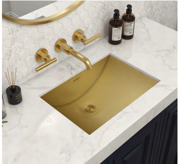
Ruvati Ariaso Sink

Imagine a private wellness oasis in a beautiful outside setting. The Outdoor Shower by Gessi is a wonderful addition to an al fresco living space. From an aesthetic perspective, the shower is sleek and sculptural with a simple, tubular design. It is offered with four different knurling patterns and in three stunning finishes. Each shower can be customized with a selection of adjustable showerheads and special sprayers that can be mixed in a variety of intriguing combinations. The result is an outdoor shower experience like no other, creating a sense of freedom and rejuvenation that refreshes the body, mind and spirit. Gessi constructs each shower unit from premium 316 stainless steel and uses their signature PVD technology to produce a finely detailed surface that is perfectly suited to withstand the elements with ease.