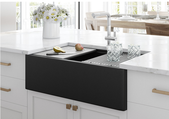
Epicast Workstation Sink by Ruvati

The epiCast series from Ruvati features an apron-front farmhouse style that brings color and character to the kitchen with beautiful granite composites that are a fresh alternative to stainless steel. The epiCast sink has the look, feel and durability of natural stone. It is crafted from 80% crushed granite and colored all the way through for a consistent, luxurious look that will never discolor. The series is offered in three color options – Matte Black, Matte White and Matte Gray and comes with integrated ledges that serve as tracks for handy accessories that slide into place as needed.