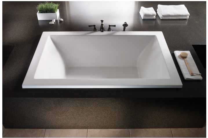
DoloMatte from MTI Baths on the Andrea 13

With its smooth-as-velvet surface and beautiful milky white matte finish, it is no surprise that the new DoloMatte™ material from MTI Baths has quickly become very popular. So popular, in fact, that the company has opted to expand their initial offering to now encompass most tubs in their Designer Collection, including drop-ins, undermounts and Sculpted Finish® tubs. The thermoformed material is unique in its moldability and preparation process, which