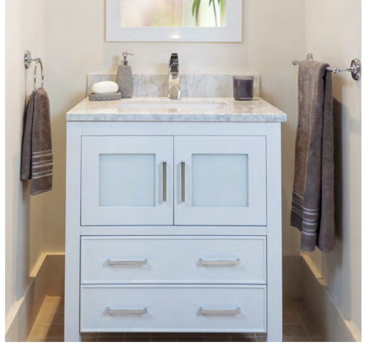
Contemporary Vanity from Lenova

The 24" freestanding Contemporary Vanity from Lenova is the perfect choice for a powder room or small alcove in a master bath. Its clean, transitional style with frosted glass door inserts compliments almost any design, and the pricepoint is surprisingly modest for a quality vanity made in the USA. Lenova combines hardwoods with furniture-grade plywood to make a thicker case that is guaranteed to stand up to the toughest bathroom environment without warping or splitting and all the stained and painted surfaces have