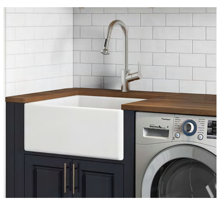
Ruvati 23" Fiamma Fireclay Farmhouse SInkFarmhouse SInk

quarters without sacrificing style or functionality. Let's take a look at some versatile kitchen and bath products that easily fit into any compact space.