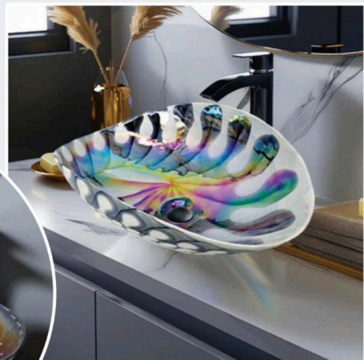
ABOVE: Ruvati's Murano glass seashell vessel in Spira Luxe Pearl White