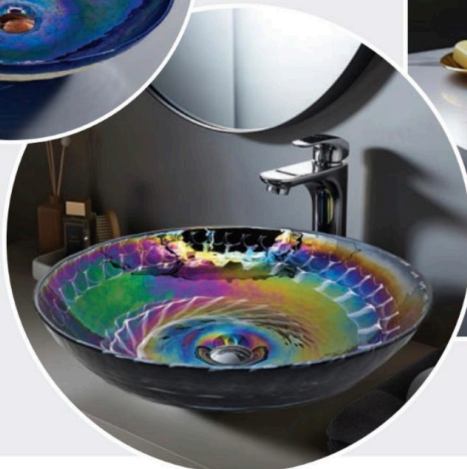
RIGHT: Ruvati's Murano glass circle vessel in Cosmic Black

Murano is to glass what caviar is to food. The mere mention of the name instantly denotes legacy, pedigree, and superior artistry. Ruvati's new Murano Collection of hand-blown glass sinks certainly lives up to that description. The new line offers two styles: a sleek circular basin and a seashell design in vivid colors of blue, green, brown, or black with a glossy finish that make them ideal choices for a standout powder room. ruvati.com